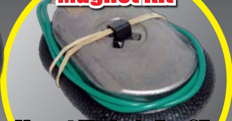
Magnet Kit, including Clip and Spring PN 339010