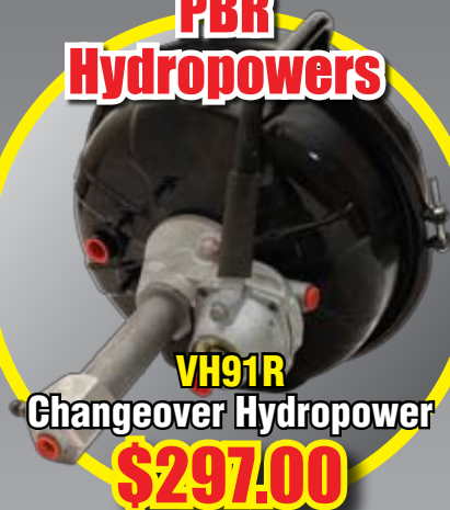
VH91R Changeover Hydropower $297.00