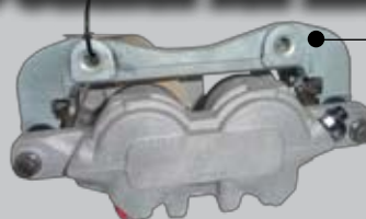
BA/BF FALCON Front/Rear Calipers, including revised pistons and pins to prevent retraction and noise issues.

Our calipers come with everything you need for a professional repair, including hardware.