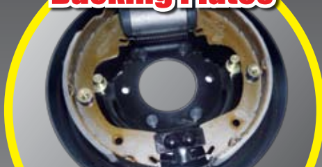
9" x 1 3/4" Backing Plate Assembly PN 311100/1