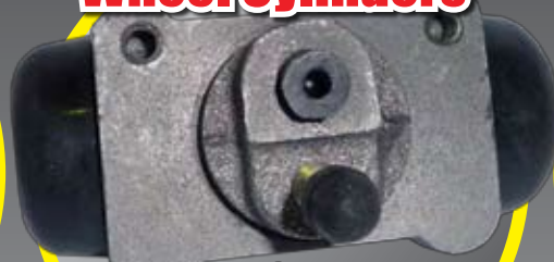
Wheel Cylinder PN 319010