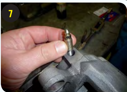
7 Screw into hole – you will need a tube spanner to tighten firmly.