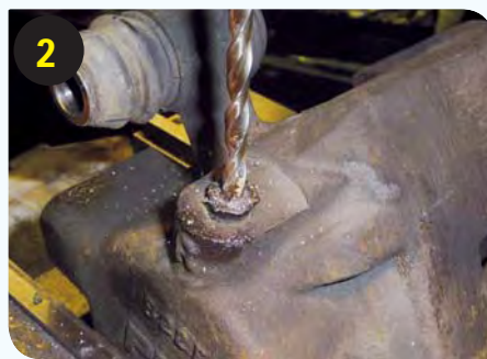
2 First we dismantle the caliper, then drill out the old bleeder, starting with a small drill, then using a larger one.