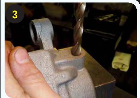
3 Once old bleeder is out, use a 25/64" bit to drill out hole. (We also bead blast the caliper.)