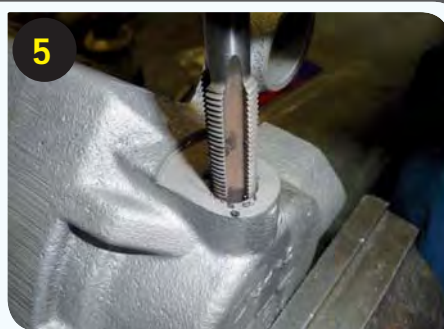
5 Tap out the hole with a 7/16" - 20 tap.