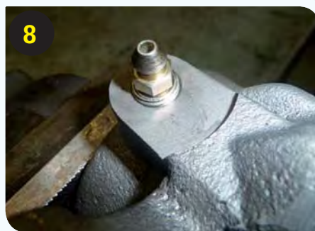
8 The finished job!! A cost effective repair rather than sourcing another caliper.