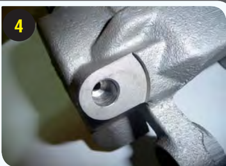
4 The bleeder hole ready for tapping.