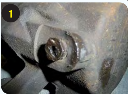
1 Here we are presented with the classic broken bleeder problem.

Not an uncommon problem faced by automotive repairers is having a bleeder break off or round off – especially in older calipers. NBS have the ideal solution with the Partwise® Bleeder Repair Kit. It is a good idea to have a couple of these kits on hand for when the need arises, or simply send your caliper to NBS and we can repair it for you.