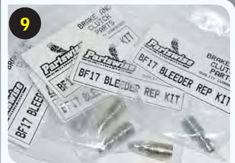
9 Partwise® Bleeder Repair Kits – in stock and ready for dispatch!!